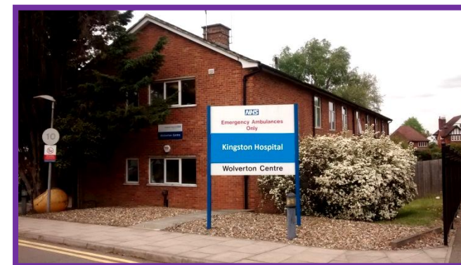
Appointments every Wednesday from 3.00pm

A sexual health service for people of all ages, with learning difficulties or Autistic Spectrum Disorder