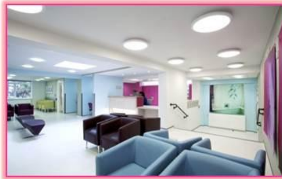
A photo of inside the Wolverton Centre

At The Wolverton Centre, Kingston Hospital NHS Foundation Trust, Galsworthy Road, Kingston, Surrey KT2 7QB.